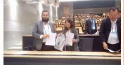
Samar State University, Philippine