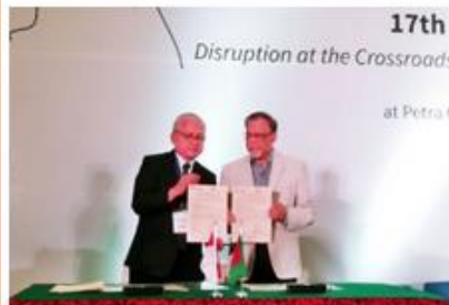
Universitas Internasional Semen, Indonesia