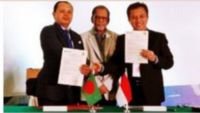
Sanata Dharma University Indonesia