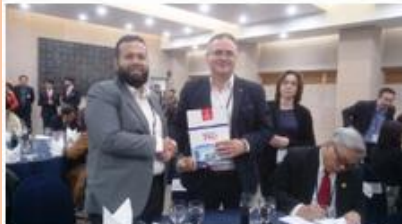
Danubius University Galati, Romania