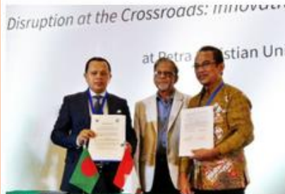
State Polytechnic of Ambon, Indonesia