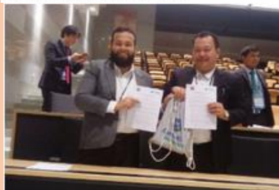
Naval State University, Philippine