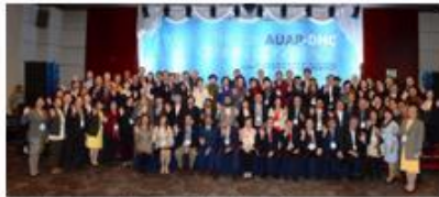
University of Mindanao, Philippine