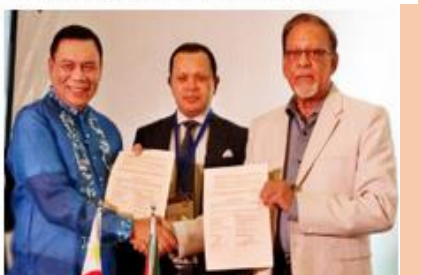
Western Colleges Inc Philippines

Academic Linkages: http://daffodilvarsity.edu.bd/international-linkage