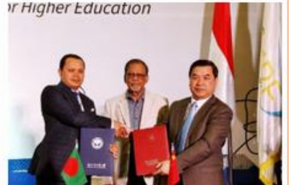
Guangdong University of Foreign Studies, China