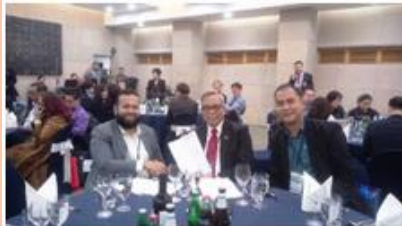
Wesleyan University, Philippine