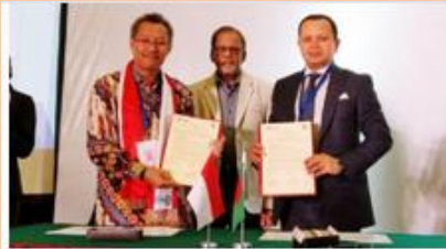
Institut Teknologi Del Indonesia