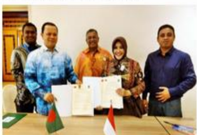
Universitas Ubudiyen, Indonesia