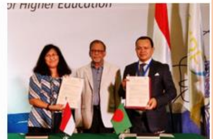
Universitas Kristen Maranatha, Indonesia