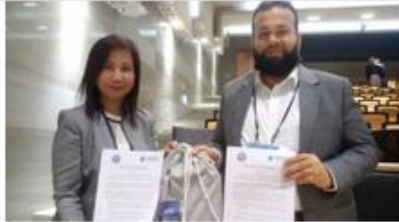
Southern Leyte state University, Philippine