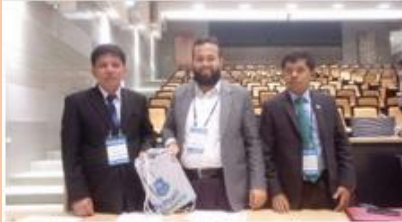
Tarlac State University of Philippine