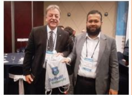
University of Applied Sciences Upper Austria