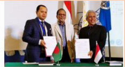
Soegijapranata Catholic University, Indonesia