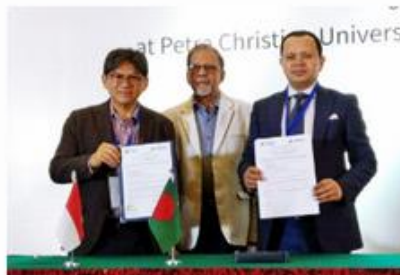
Universitas Kristen Krida Wacana, Indonesia