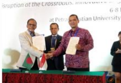
Triatma Mulya Institute of Economy, Indonesia