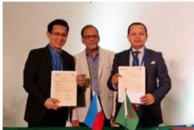
Cabuyao university, Philippines